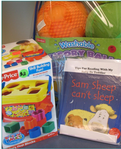
Pictured here is a bed times story, a bucket of shape blocks and a soft set of balls!

For donations to purchase new toys, please contact Building Families CAPP Coordinator at: 515-832-1791 ext. 204