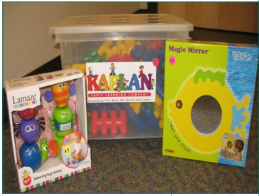
Pictured here is a colorful bug stacker, a fun linking set and a baby mirror!